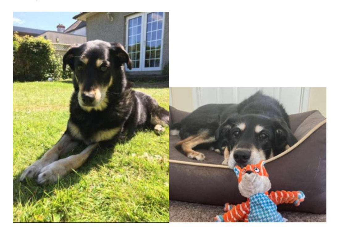
Sirius Sirius is named after the Dog Star. She's a Collie Alsatian cross and her favourite subject is History!

This is Daisy. She just turned one and is a dachshund-chihuahua cross. She has lots of energy and loves to take long walks, play fetch, and play tug-of-war! Daisy loves people but can get a bit nervous when she meets you for the first time so she might bark. Some nice rubs or a piece of chicken usually calms her down! Daisy is very affectionate once she gets to know you, so you might have to deal with some slobbery kisses!!